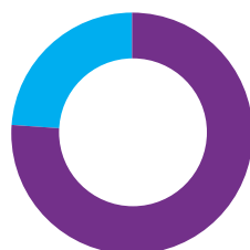
Gifts by Type (gross)

distributed to support Calgary's students