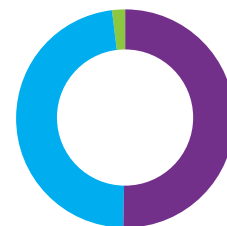
Gifts by Fund Type (net)