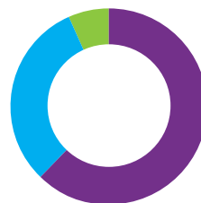
Grants by Distribution